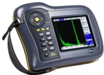
Sonatest D70 UT Set, an example of the equipment we calibrate.